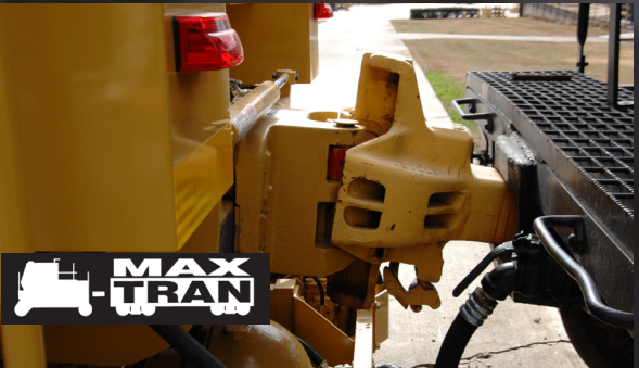
Automatic Weight Transfer System

The number of cars moved may vary based on track conditions, load, and other factors.