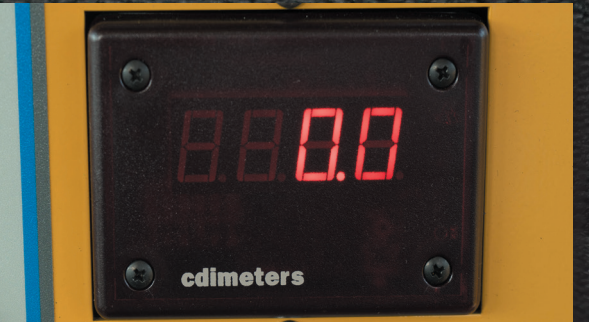
Standard Train Air Charge Indicator