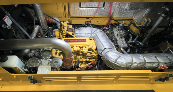
QSL-9 Liter Cummins Electronic Turbocharged Diesel Engine-Tier IV