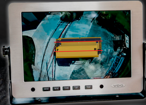
Patent Pending Safe-T-Vue™ 360° Visibility and Railing System Monitor